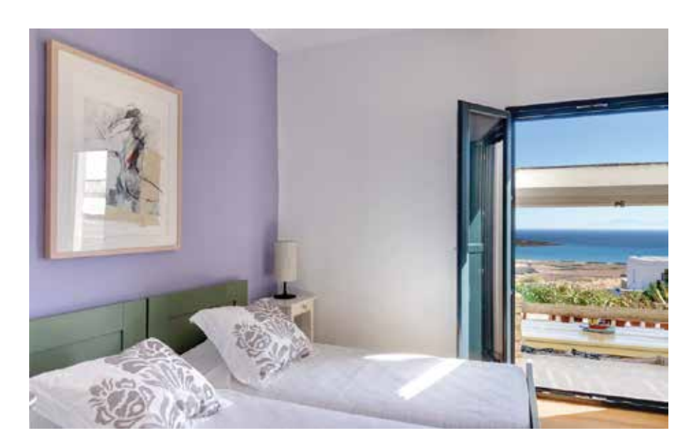
Villa Porithea - Ground Floor Bedroom 1 two single beds / sea view / shared bathroom with bedroom 2

Double occupancy 1.269€ per person Single occupancy 1.769€ per person