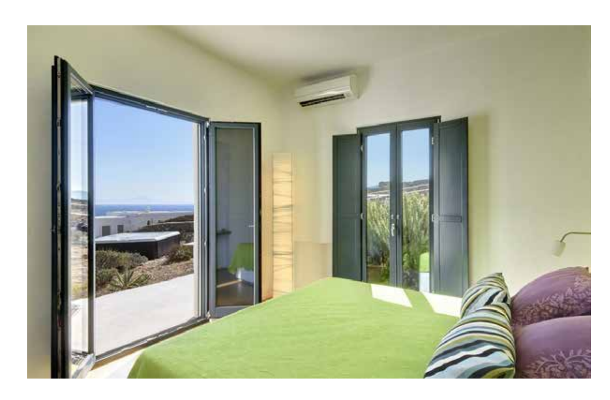
Villa Porithea - Ground Floor Master Bedroom Queen size bed / sea view / en-suite bathroom / outdoor jacuzzi

Double occupancy 1.569€ per person Single occupancy 2.169€ per person